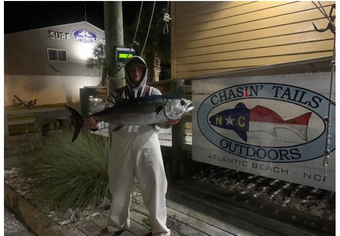
(from Victor Tucker)